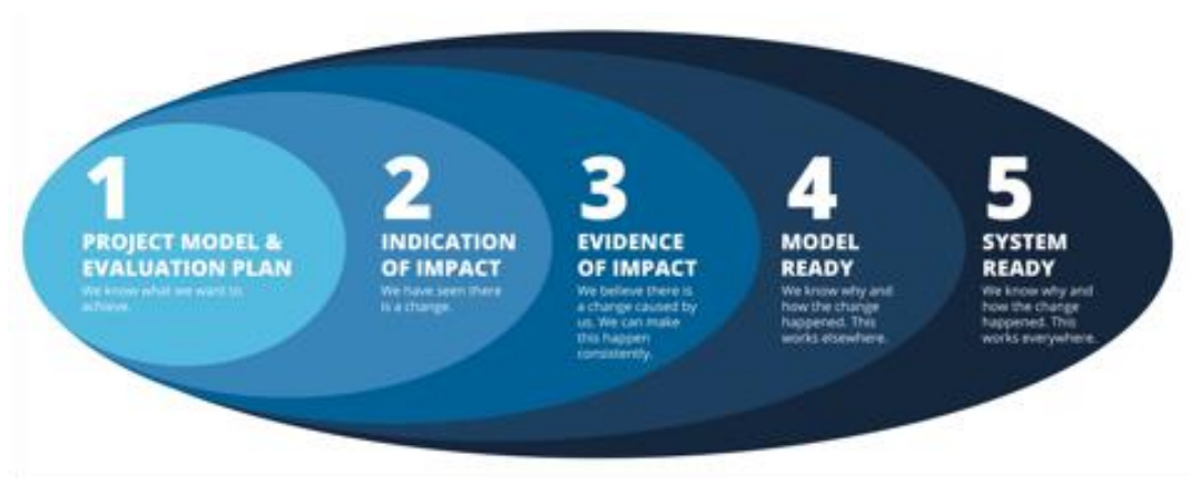
Project Oracle's Standards of Evidence