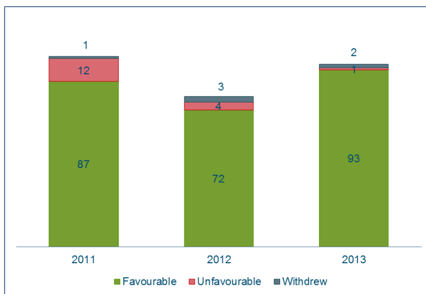
Graph 2. Result of the evaluation of modifications to degree programmes (2011-2013)